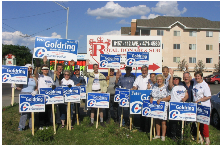
Successful campaigns are the result of a lot of effort and enthusiasm by volunteers.

By most estimates, we are less than two years away from another federal election. This means that there is much to be accomplished in a comparatively short period of time. I have found my parliamentary work this summer to have reflected this sense of urgency. I look forward to working with all of you to advance our country's interests over the coming months, and thank you as always for your continuing confidence and support.