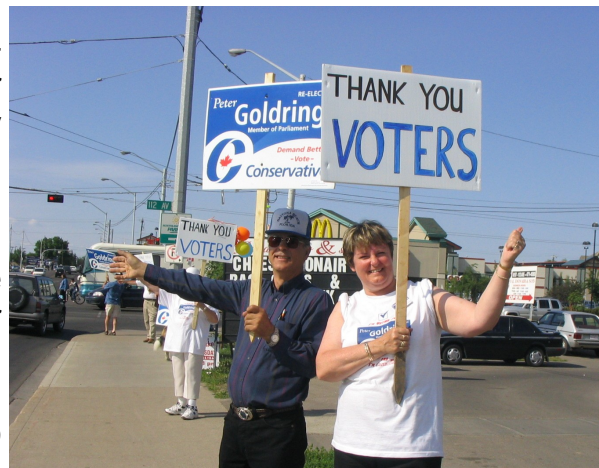
Taking time after the Election to thank the voters of Edmonton East.